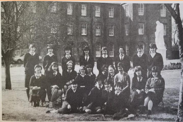
The passing of an era. The last Ursuline Boarders

Recognise anyone you know? Another wonderful old photo was sent to us this week of the last ever Ursuline Boarders, the sixth years of 1984. In that year, there was only twenty-two boarders, a stark contrast to the one hundred and fifty girls living in the boarder house when these girls were starting their 1 st year journey, only six years before! Incredible to think this photo was taken nearly 50 years ago—I wonder where these girls are today.